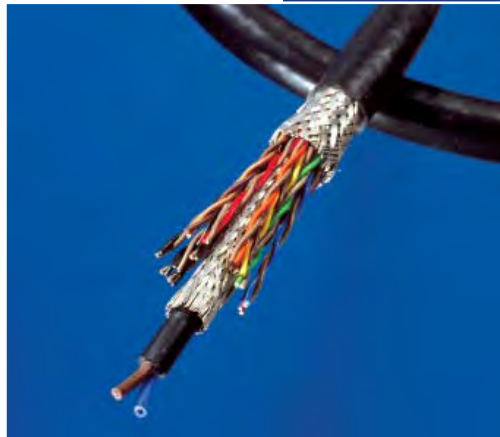
Power wires screened from overall screened signals