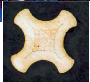
Typical crimp X-section